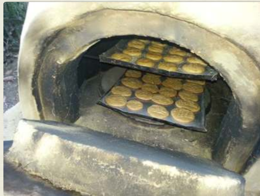
Central Plateau, Haiti