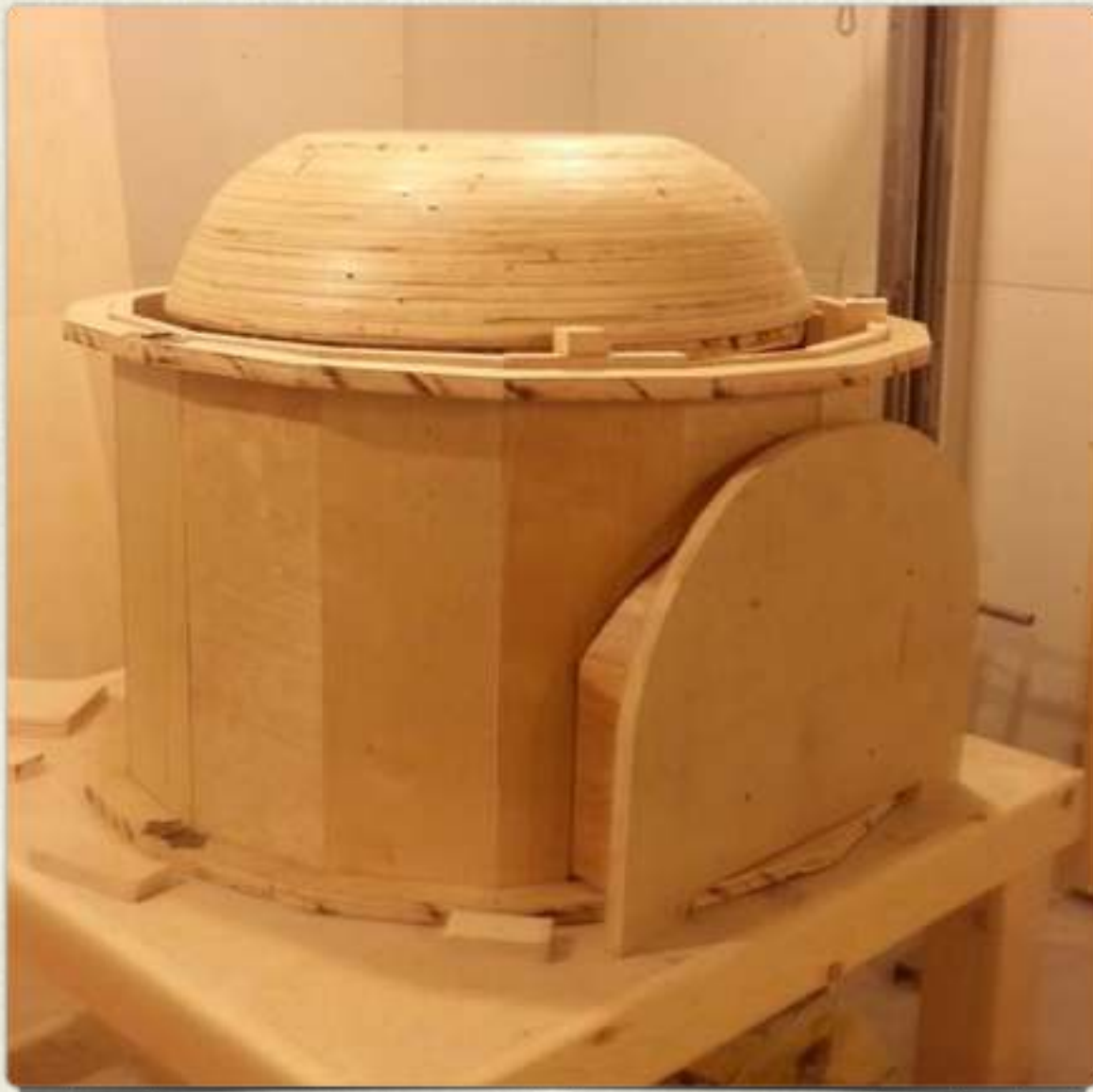
NewDay mold Haiti