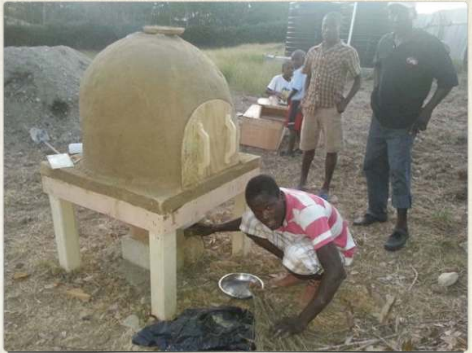
Central Plateau, Haiti