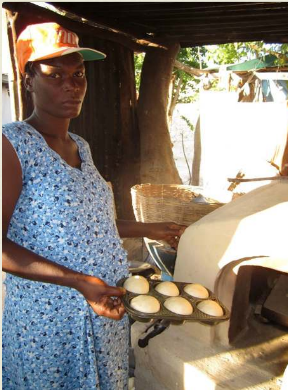
Petit Bois, Haiti