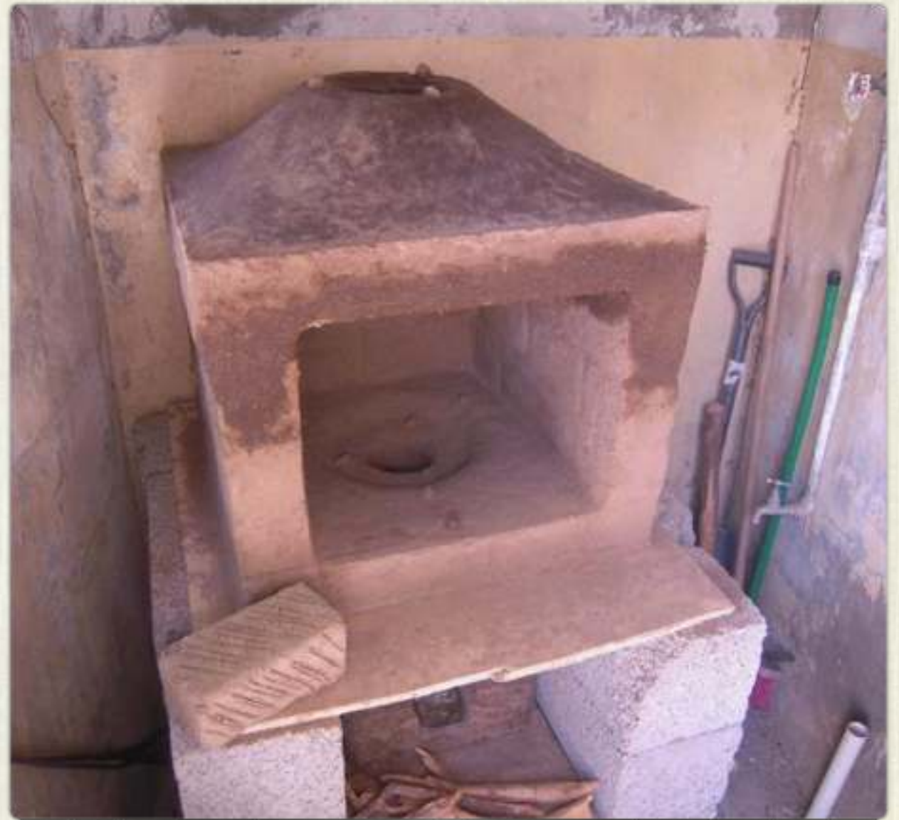
Unnamed Middle Eastern country