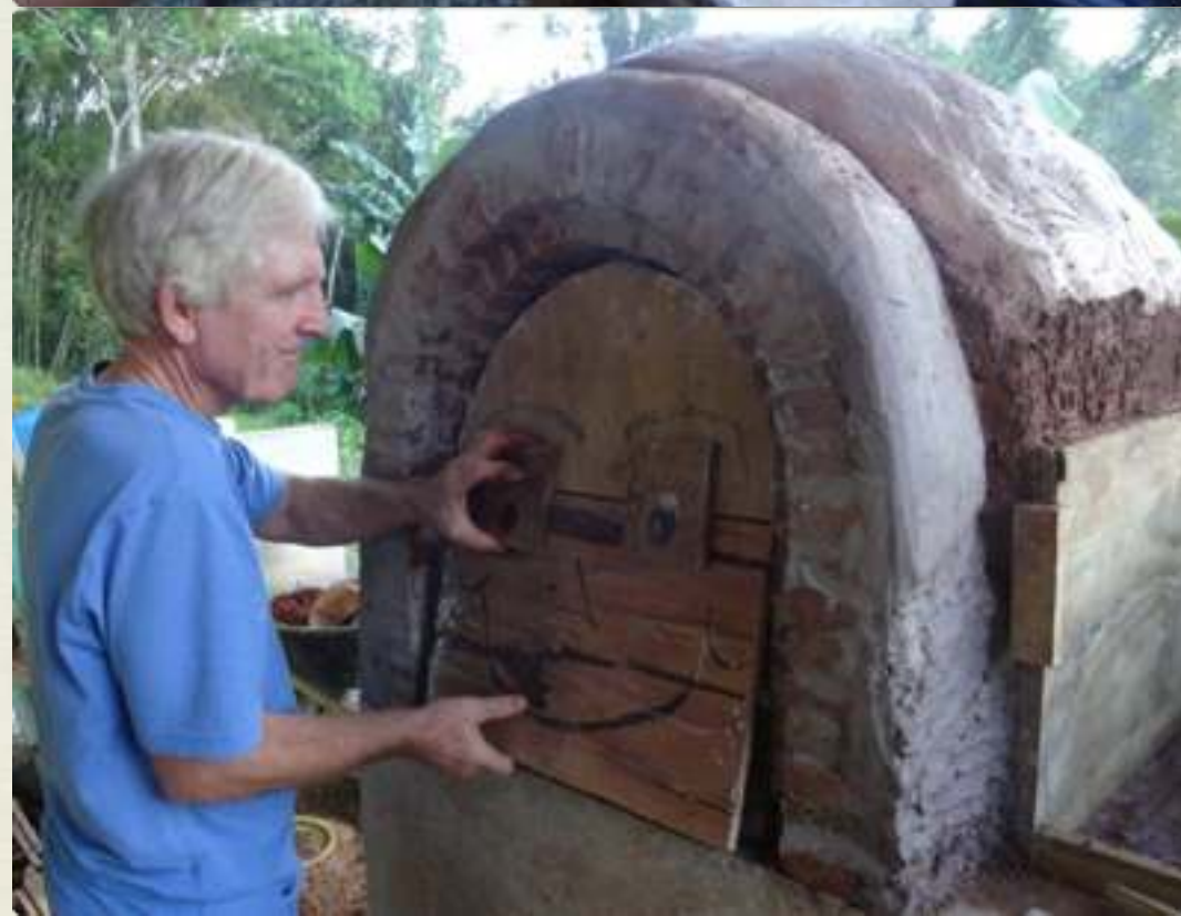
Las Marias, Puerto Rico