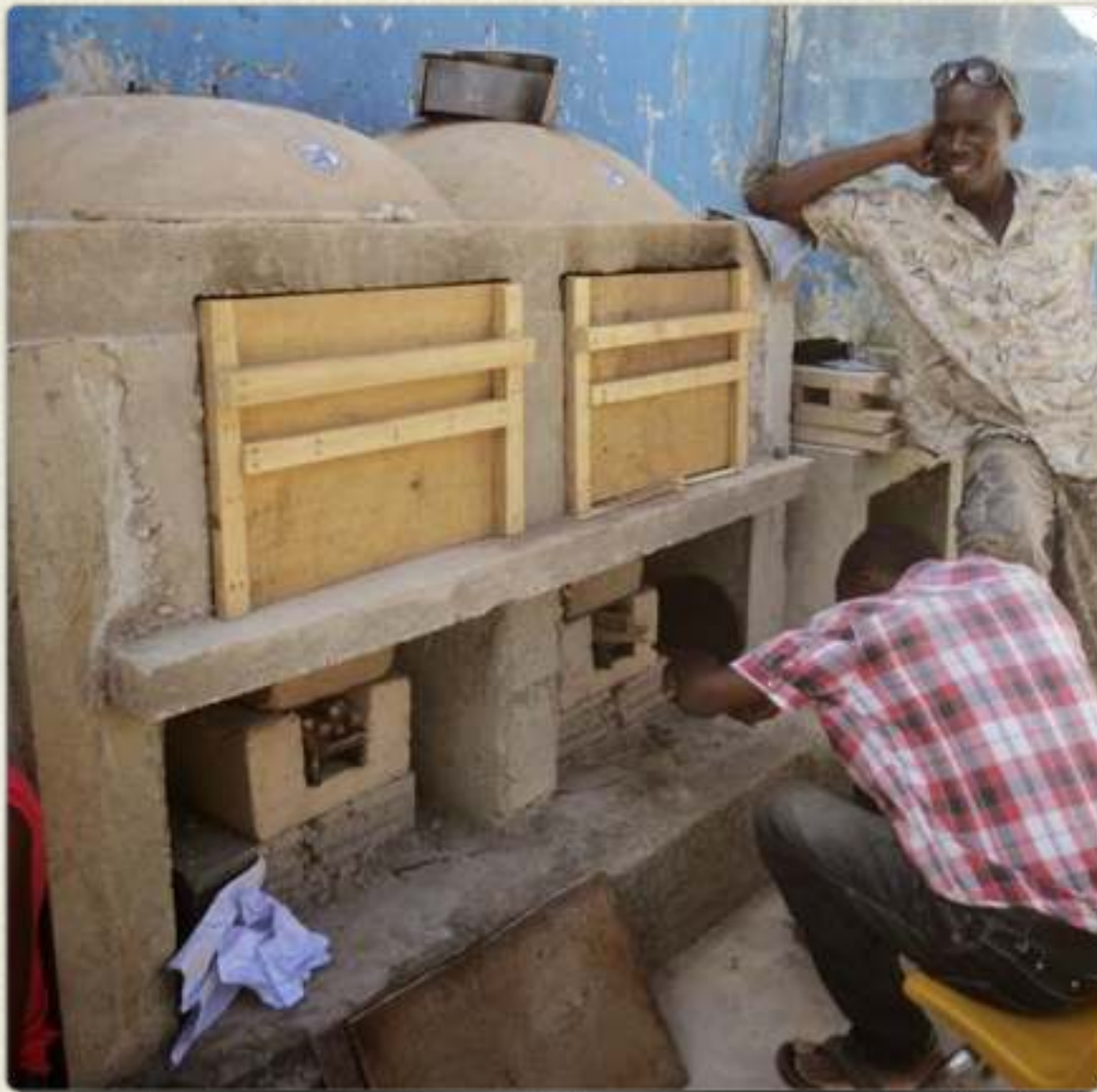
Les Cayes ovens Haiti