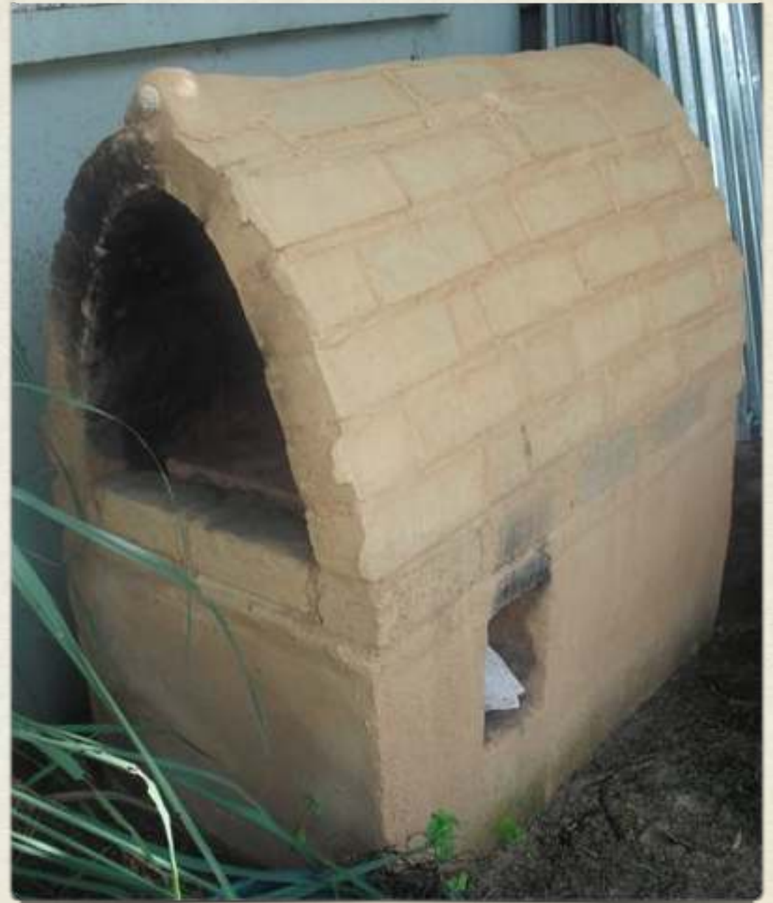
Dili, East Timor