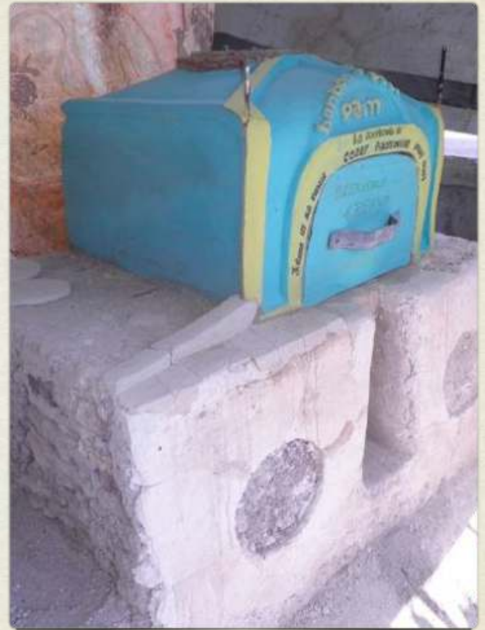
Petit Bois, Haiti