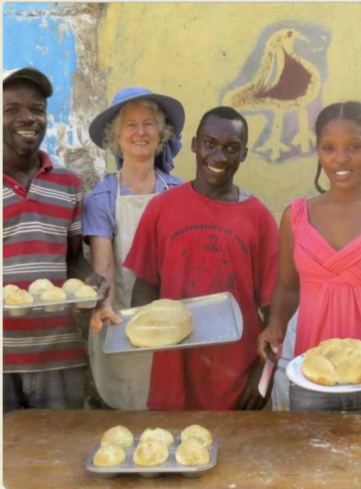
Les Cayes, Haiti