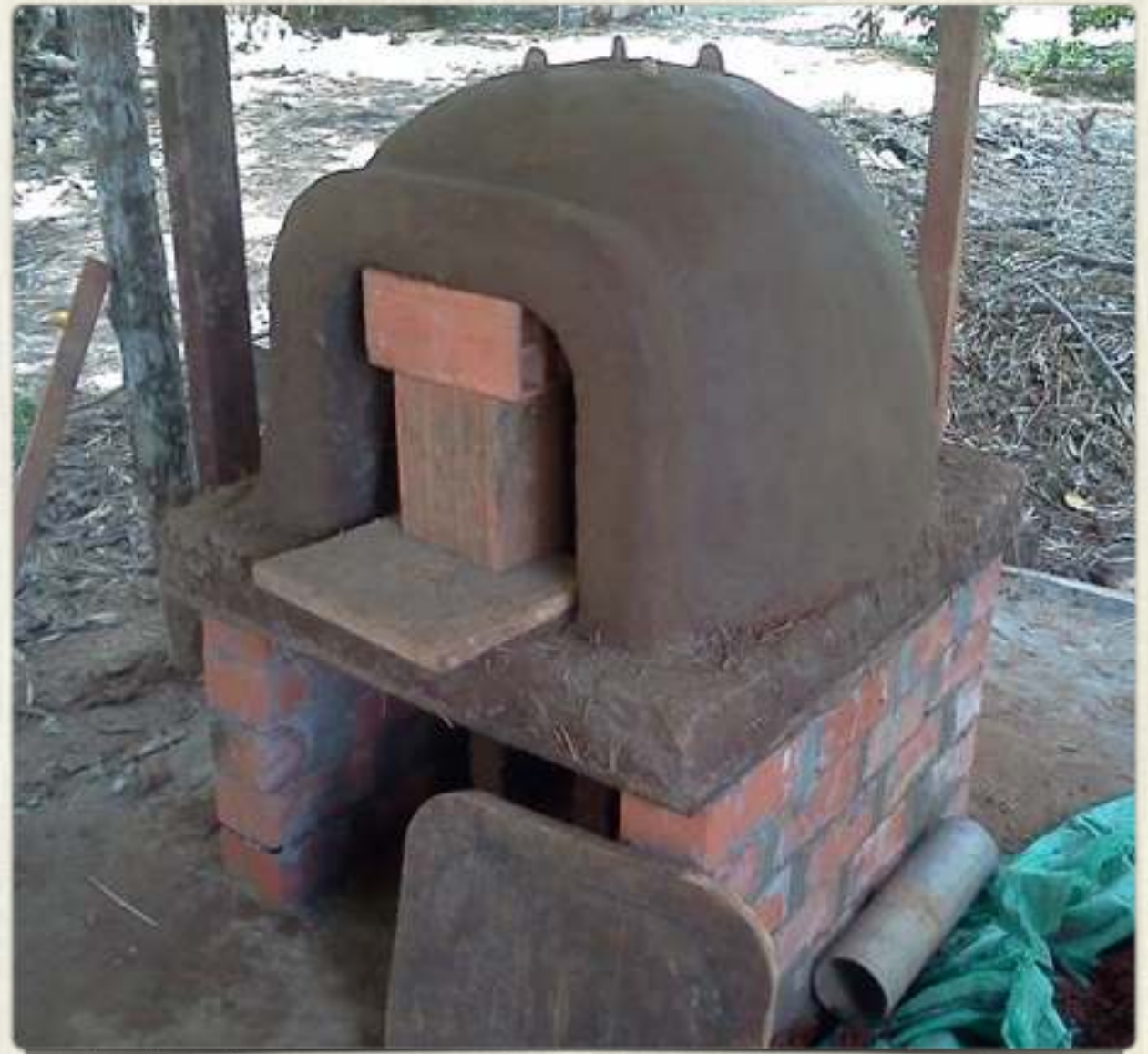
Eco Selva oven Peru