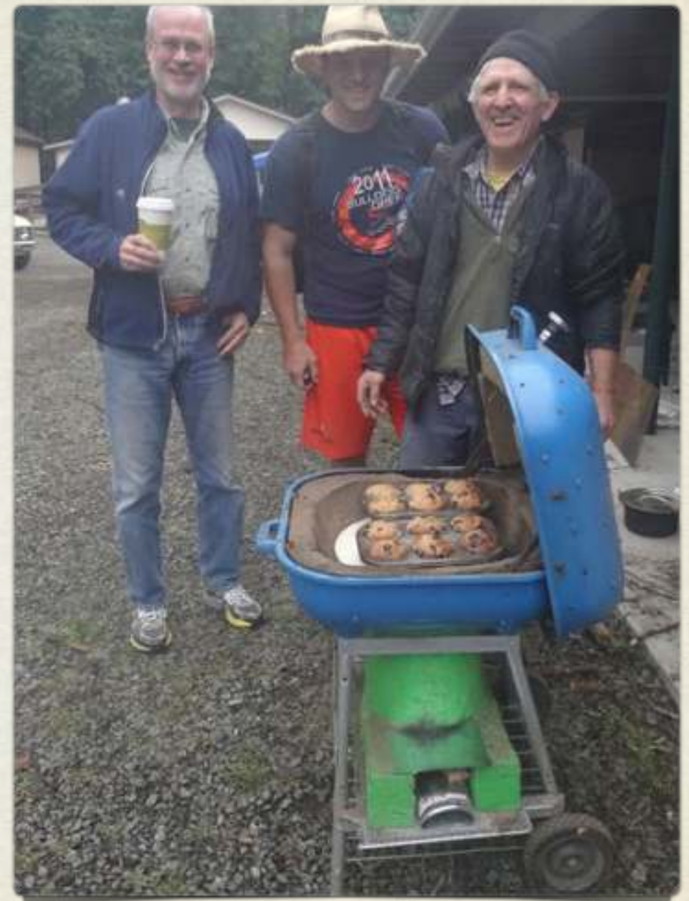
Aprovecho Stove Camp, 2014